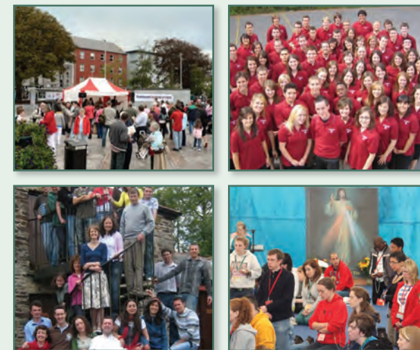
Above: A snapshot of some successful applicants

We understand Home Missionaries to be those laity, religious and priests who are dedicating their lives and resources to the New Evangelisation in Ireland through their projects and service to the Church. Funding for such missionaries and their projects is normally granted through funding rounds that are advertised on our website. Usually there will be two rounds each year. Applicants will need to apply using the downloadable forms and present a good case for any funding that they are seeking. Full details for applicants, including an outline of the criteria used in considering applications, are available at www.thenewevangelisationtrust.ie/applicants